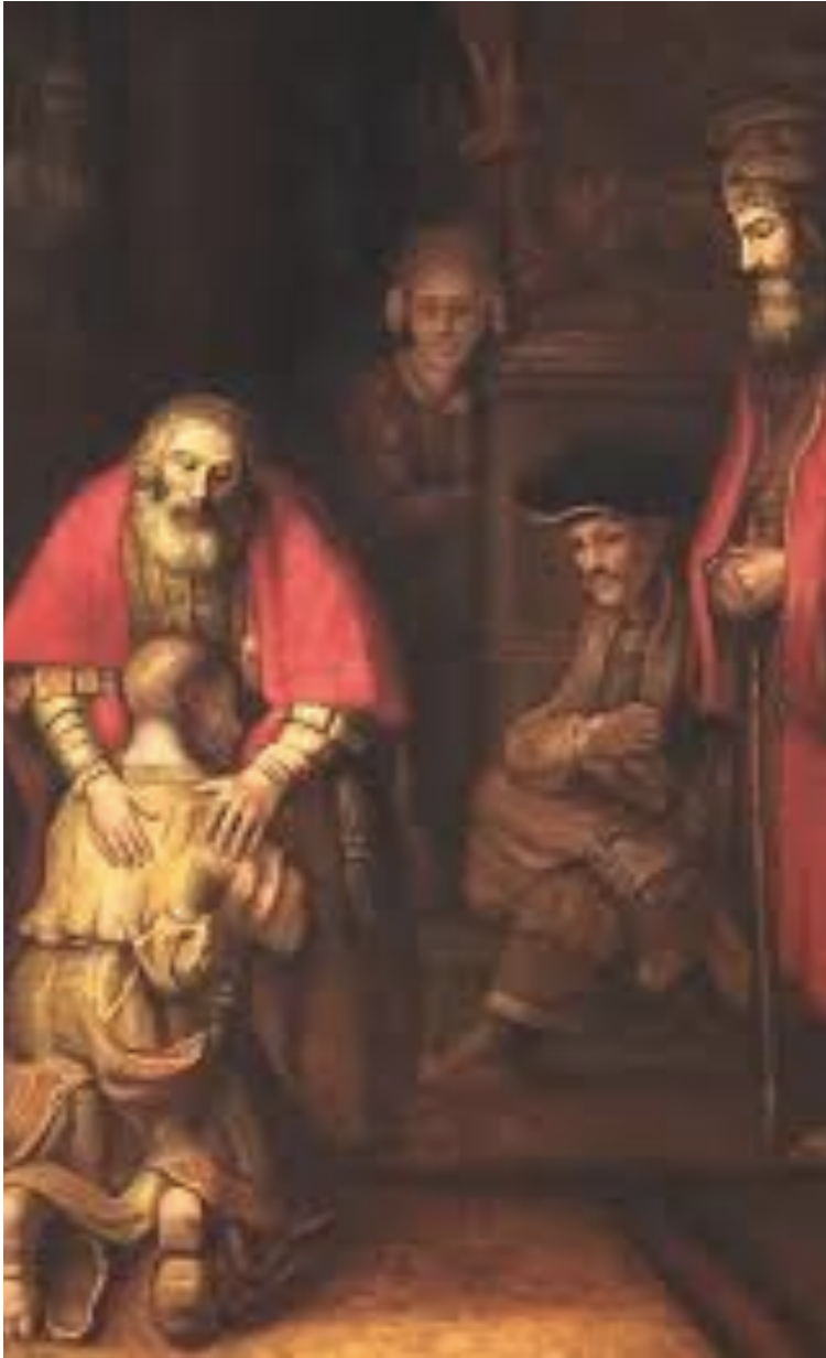
The Prodigal Son (Painting by Rembrandt)