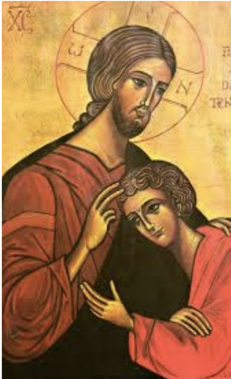
One of his disciples – the one whom Jesus loved – was reclining next to him (John 13:23)

GOD IS LOVE, AND THOSE WHO ABIDE IN LOVE ABIDE IN GOD, AND GOD ABIDES IN THEM. (1 JOHN 4:16)