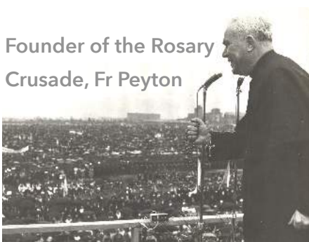
Founder of the Rosary Crusade, Fr Peyton

Fr Peyton died peacefully on June 3, 1992 , holding a rosary, in a small room at the Little Sisters of the Poor Jeanne Jugan Residence in San Pedro, California. His remains were brought to the Holy Cross Cemetery on the grounds of Stonehill College in Easton, Massachusetts. On December 18, 2017, Pope Francis declared Father Patrick Peyton, founder of Family Rosary Crusade, venerable. The devotion to the rosary that was instilled in Father Patrick Peyton from a young age followed him into his priesthood and he began a mission to spread the devotion to families, writing to bishops, lay Catholics, and even non-Christians of the importance of the Family Rosary. He utilized film, radio, outdoor advertising, television, with the help of celebrities, artists, and advertisers to spread his message. Father Peyton was one of the first pioneers of using mass media to evangelize. Father Peyton organized Rosary Crusades which were rallies where hundreds, and sometimes thousands, of people would gather to pray the Rosary together. These rallies were duplicated around the world. Father Peyton said of the Rosary, "The rosary is the offensive weapon that will destroy Communism—the great evil that seeks to destroy the faith." Through his advertising for the Family Rosary, Father Peyton popularised the slogan, " The family that prays together, stays together. "